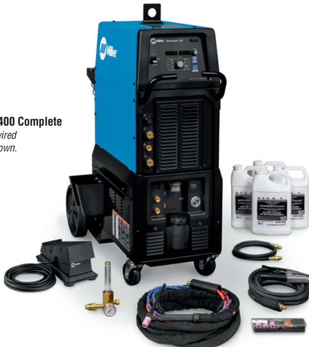
Syncrowave 400 Complete Package with wired foot control shown.