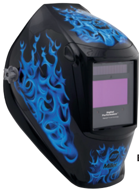
Blue Rage™ 296753