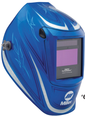
'64 Custom™ 296751