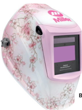
Burn & Blossom™ 296756