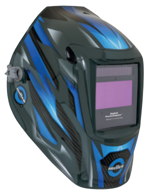
NEW! Carbon Edge™ 299616